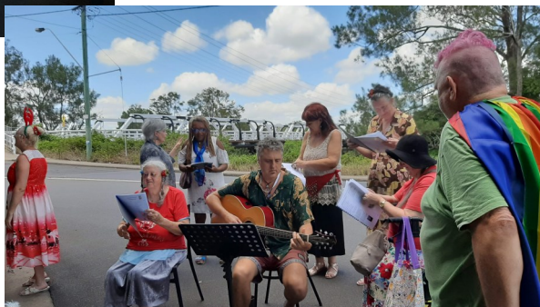
One of Lismore's finest caped crusaders and crew at Christmas